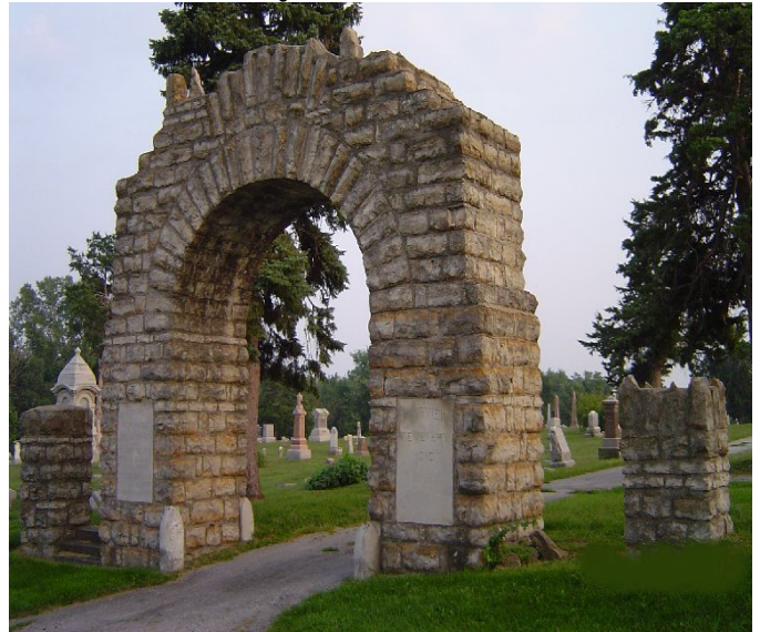
Arch at the entrance of Liberty Cemetery