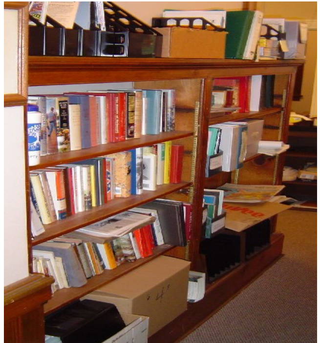
"Manschein Collection," the Civil War Round Table of Western Missouri's library, housed at the Clay County Archives in Liberty, Missouri